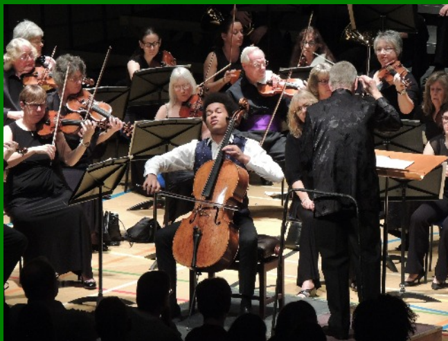
Sheku Kanneh-Mason playing his first ever performance of Elgar's Cello Concerto with MSO in 2018