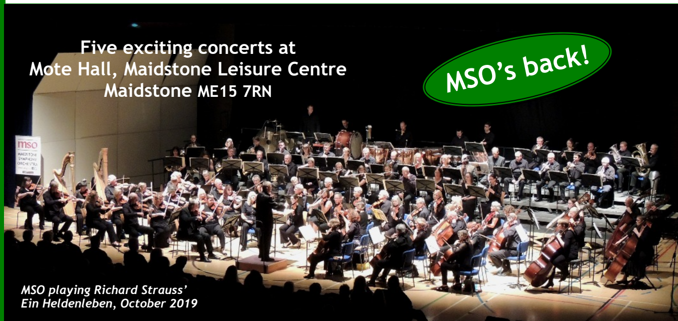
MSO playing Richard Strauss' Ein Heldenleben , October 2019

“After the interval we had Strauss’ Ein Heldenleben released upon us in all its magnificent opulence and virility” - larkreviews.co.uk