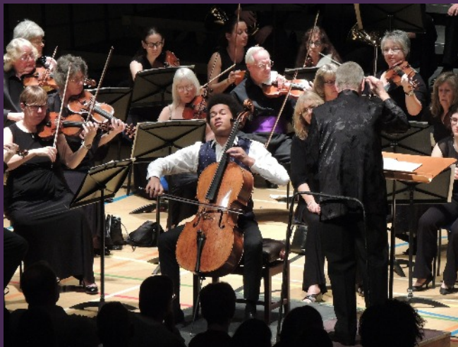
Sheku Kanneh-Mason playing his first ever performance of Elgar's Cello Concerto with MSO in 2018